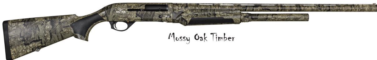
Mossy Oak Timber